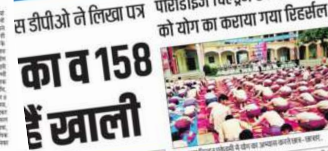
पाराडाइज चिल्ड्रेन एकेडमी में बच्चों का अभ्यास करते छात्र-छात्राएं