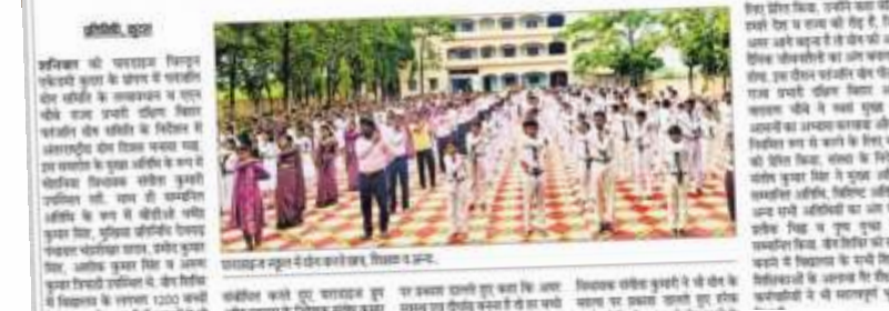
पाराडाइज चिल्ड्रेन एकेडमी कुदरा में जनाया गया अंतरराष्ट्रीय योग दिवस