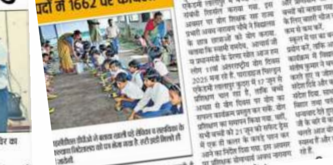
पाराडाइज चिल्ड्रेन एकेडमी में बच्चों का अभ्यास करते छात्र-छात्राएं